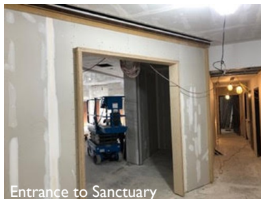
Entrance to Sanctuary