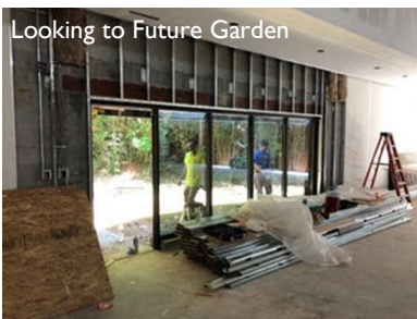
Looking to Future Garden