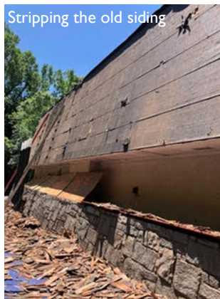
Stripping the old siding