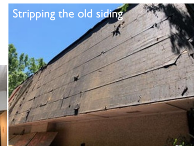
Stripping the old siding