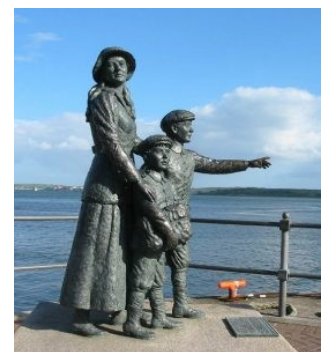
First Immigrant Ellis Island